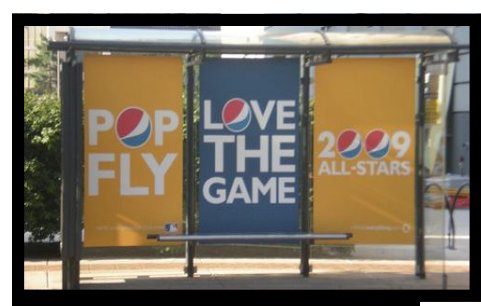
Pepsi creatively aligned its MLB All-Star activation with its national messaging campaign