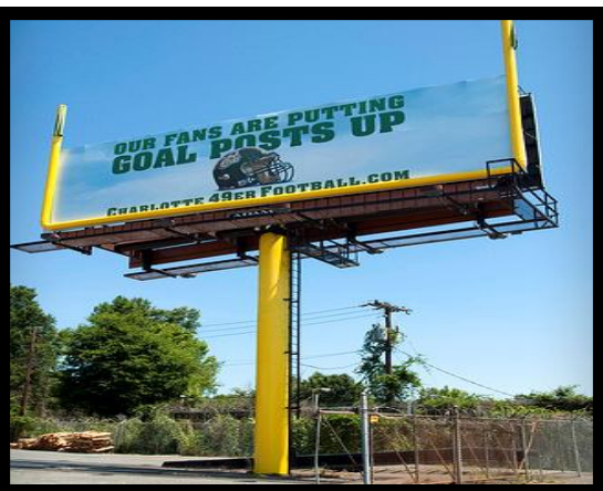
UNC Charlotte released an eye-popping billboard campaign to drive support for a new football program