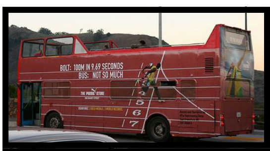
Puma's transformation of this bus enabled consumers to literally race against Usain Bolt while traveling on the road