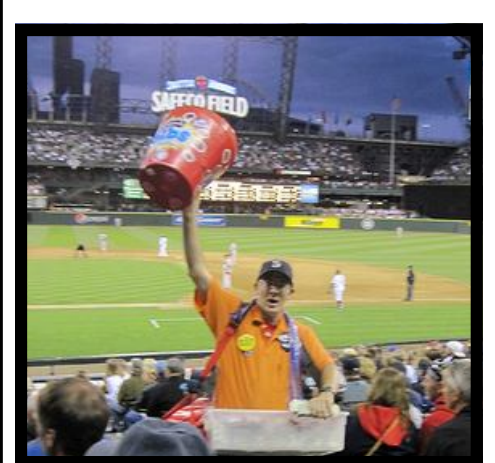
Vendors hawk giant inflatable tubs of Dreyer's Ice Cream at Safeco Field (a great awareness play in-venue)