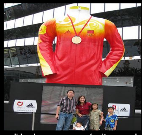
adidas drove awareness for its apparel endorsements at the '08 Olympics with a giant display outside one of its stores