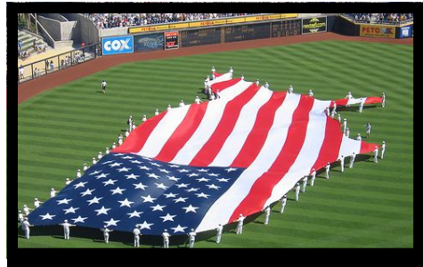
The San Diego Padres add a touch of originality to their pre-game festivities